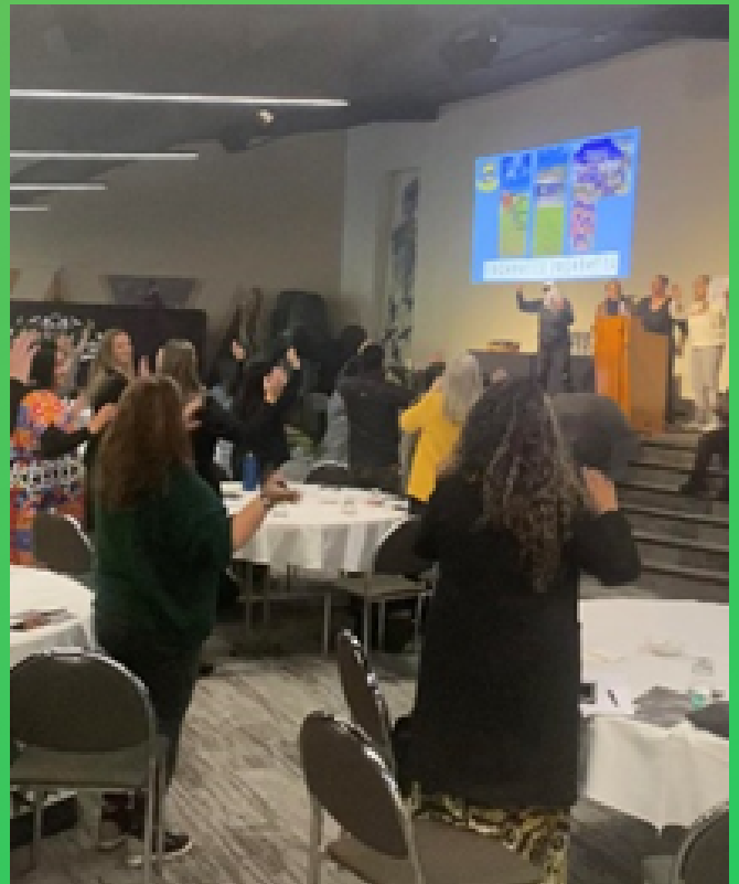
Photos from our recent Terenga 4 Graduation

Ngāti Whakaue Iho; Ngāti Whakaue Ake Ngāti Whakaue Tangata, Ngāti Whakaue Tikanga Te Taumata o Ngāti Whakaue Iho-Ake Te Puna Ora o te Iwi