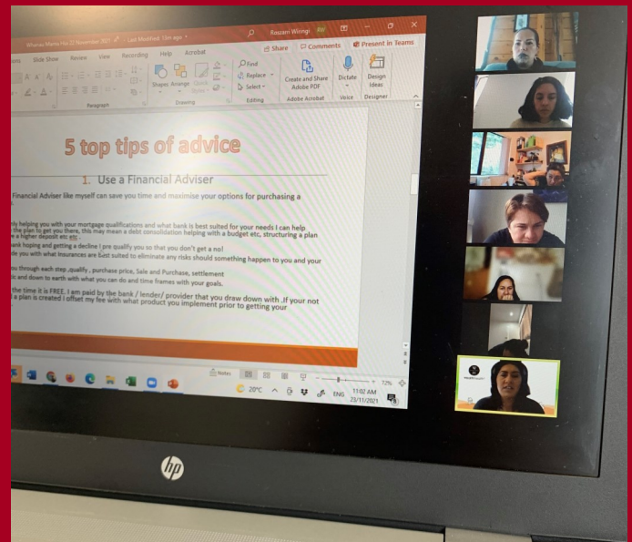
Photo: During a Whai Hua Nui Session Rangatahi internships

eight week financial capability programme delivered online. Rehe ake nei koutou ngā māmā!