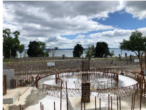
Photo above - starting the Sky Pool

The Spa build is coming along, however, due to Covid related delays, our opening date is looking to be October 2022. We will update you all as we progress next year.