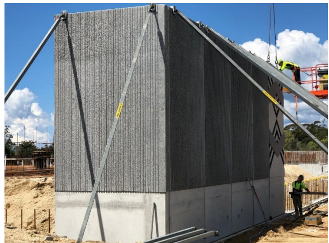
Photo above - Starting the exterior wall