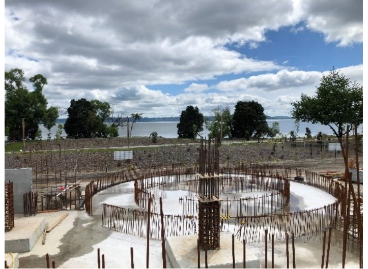
Photo above - starting the Sky Pool

The Spa build is coming along, however, due to Covid related delays, our opening date is changing and at this point in time we do not have a definitive date. We will update you all as we progress next year.